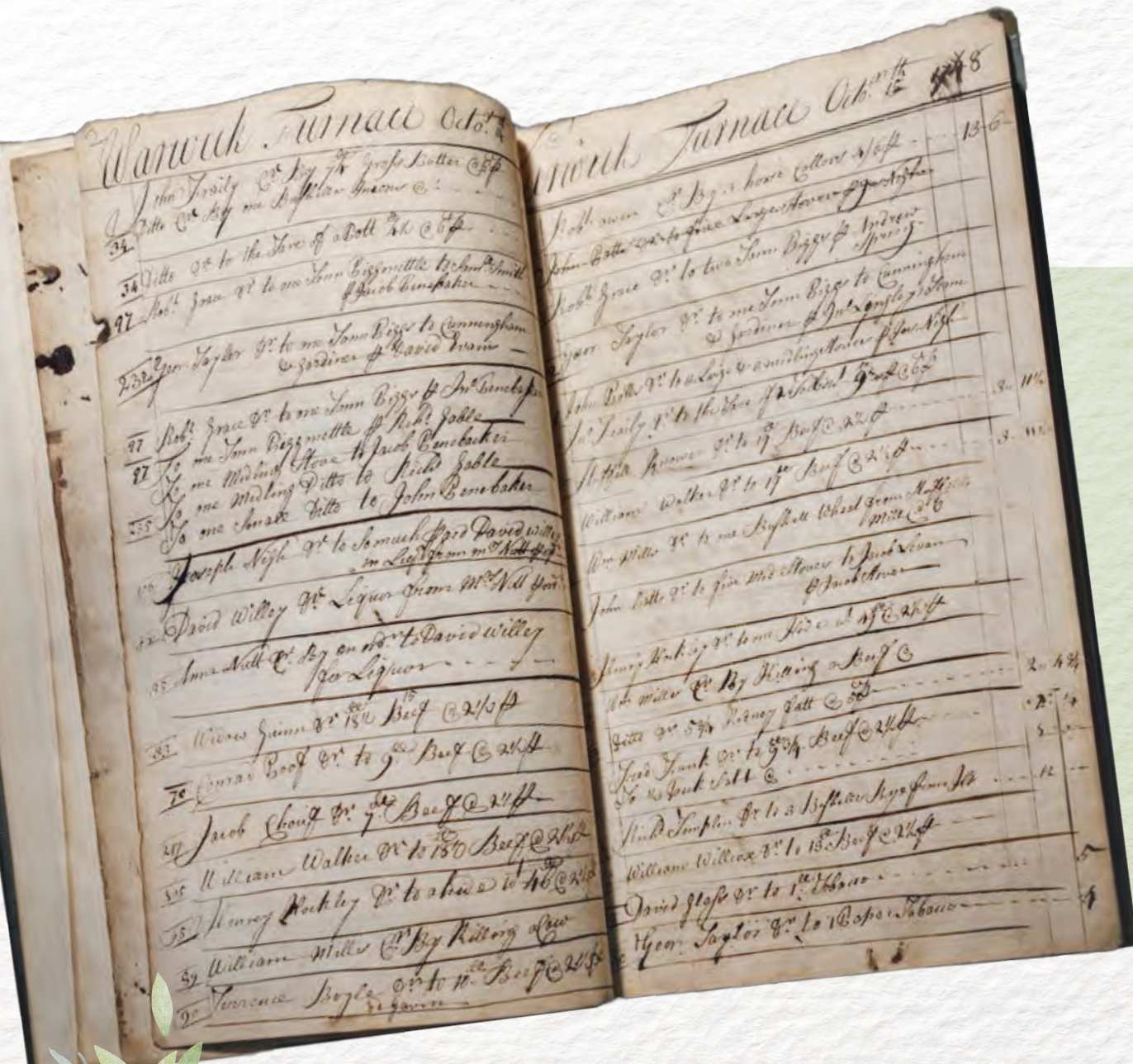
Warwick Furnace Journal 1748 Historical Society of Pennsylvania