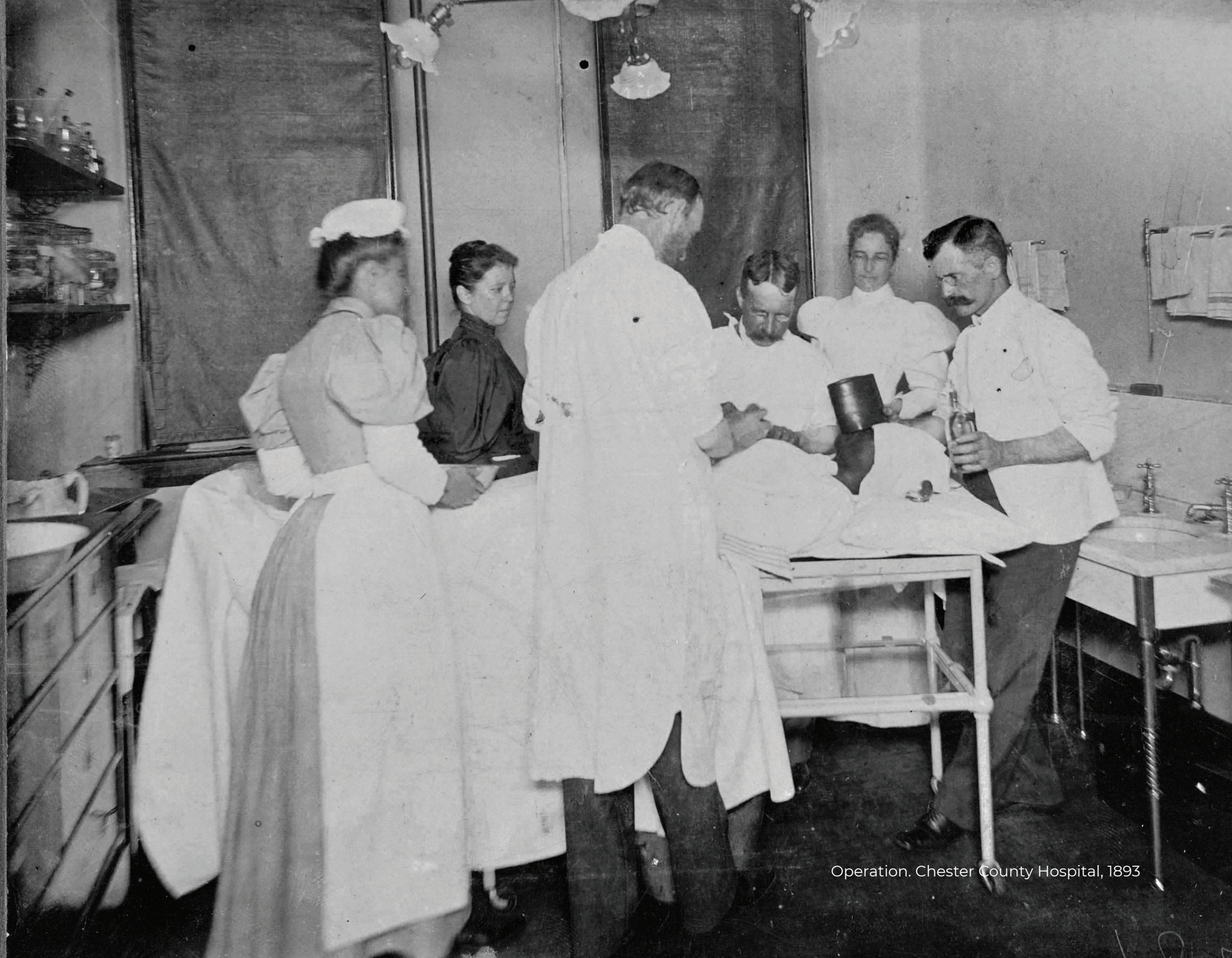
Operation. Chester County Hospital, 1893